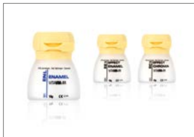
Fig. 1 VITA VM 11 effect materials